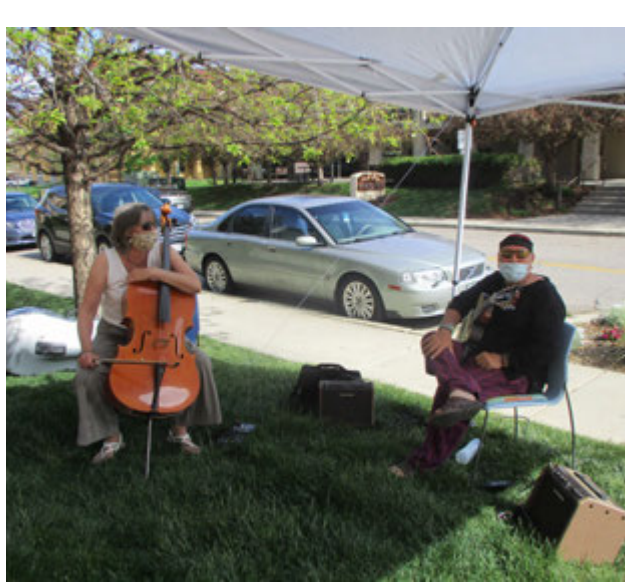
Masks and music