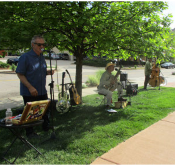
Even musicians need to social distance.