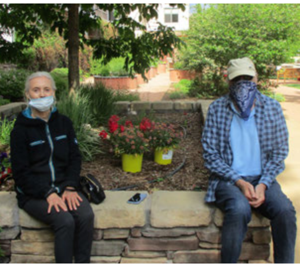
Who is that masked man?