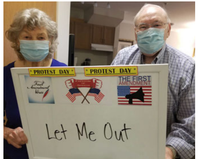
The Ullerys were seeking more freedom from the quarantine.