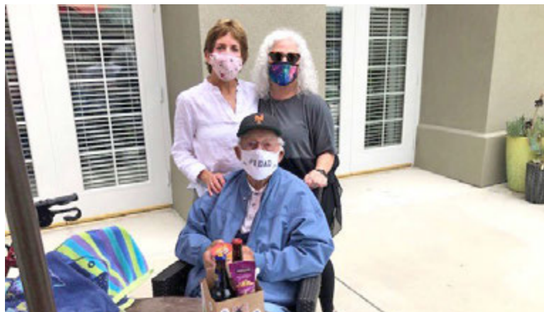
Mel's daughters share lunch with him on the patio for Father's Day!