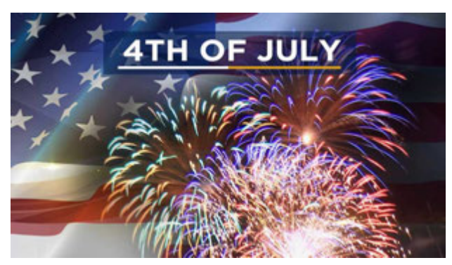
Fourth of July 2020

The Fourth of July — also known as Independence Day or July 4 — has been a federal holiday in the United States since 1941, but the tradition of Independence Day celebrations goes back to the 18th century and the