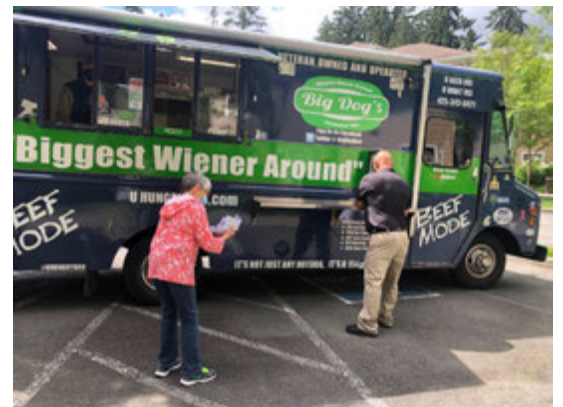
Free hot dogs for residents and employees courtesy of Four Park ... they were yummy.