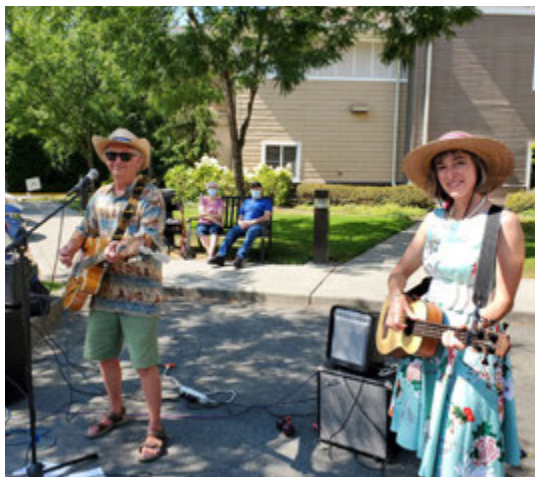
Happy Hour Entertainment