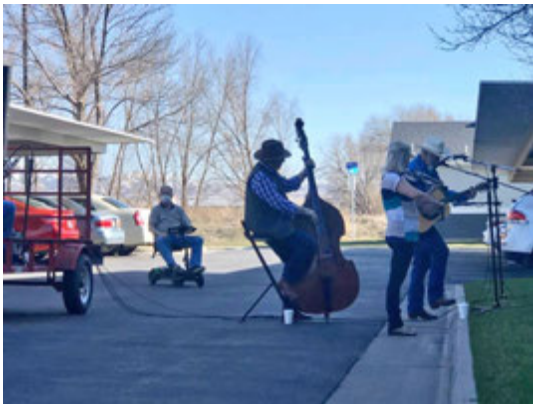
The Old Time Fiddlers