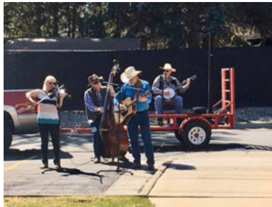
The Old Time Fiddlers