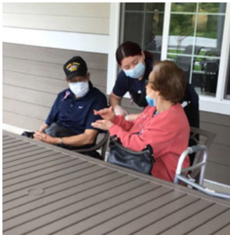
Memorial Day Event