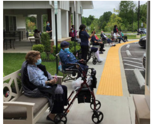
Memorial Day Event