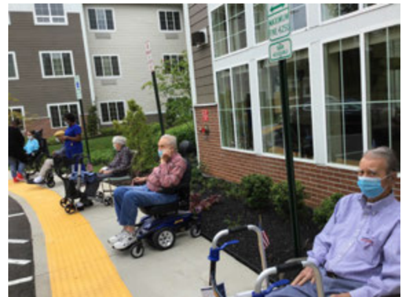
Memorial Day Event