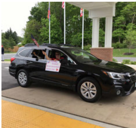
Memorial Day Event