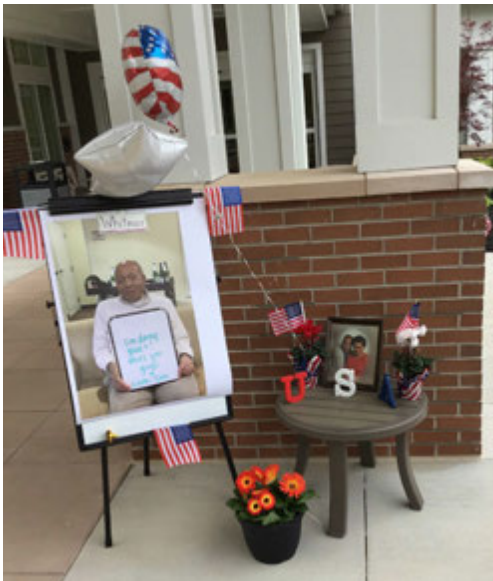
Memorial Day Event