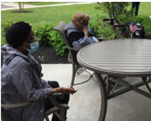
Memorial Day Event