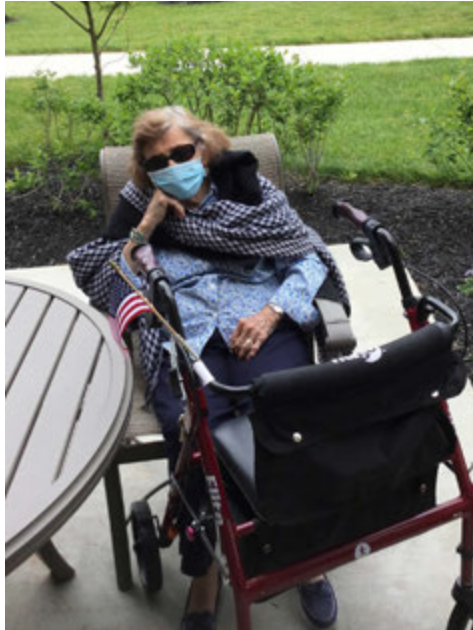
Memorial Day Event