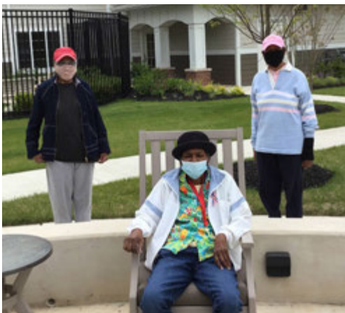
Memorial Day Event