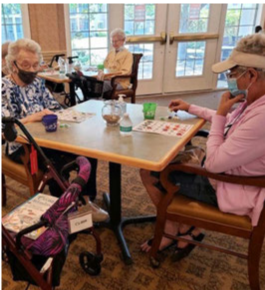
Beach Bum Bingo