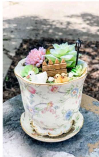
Fairy Garden Craft