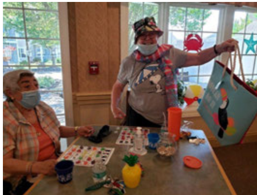
Beach Bum Bingo Winner