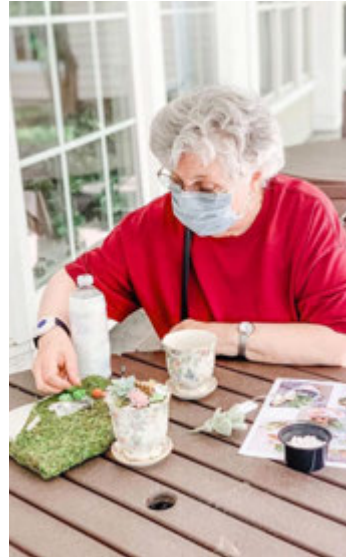
Fairy Garden Craft