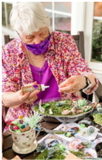
Fairy Garden Craft