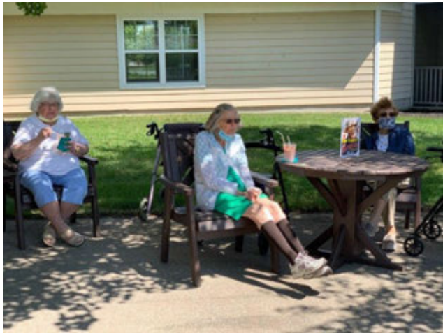
Roy Rogers Mocktail Trivia Hour