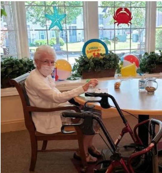
Beach Bum Bingo