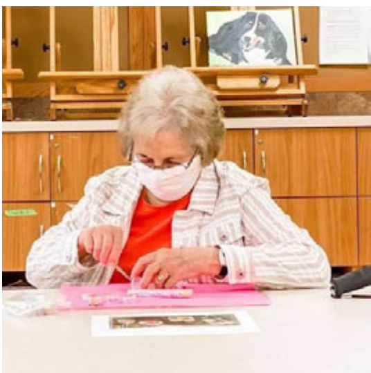
Resin charm necklaces