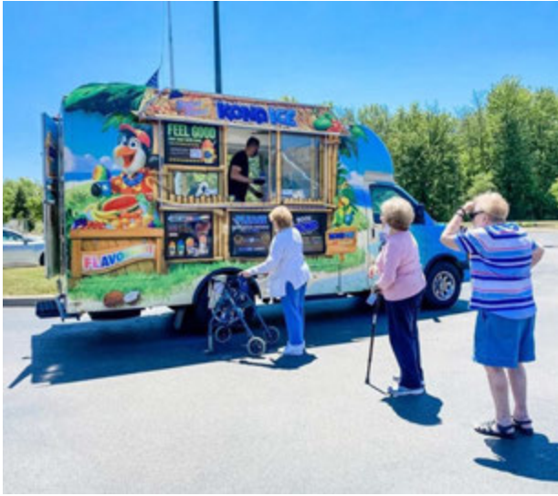
Kona Ice, anyone?