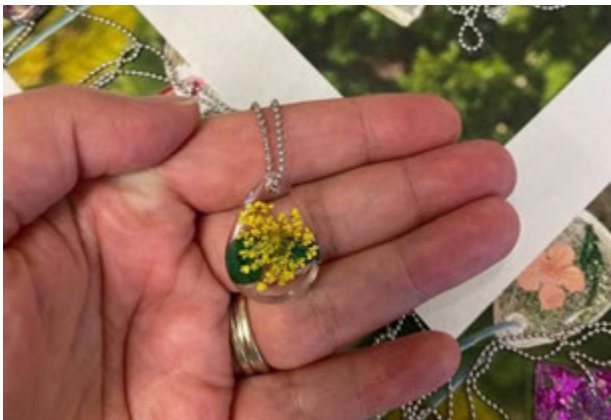
Resin charm necklaces