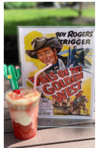
Roy Rogers Mocktail Trivia Hour